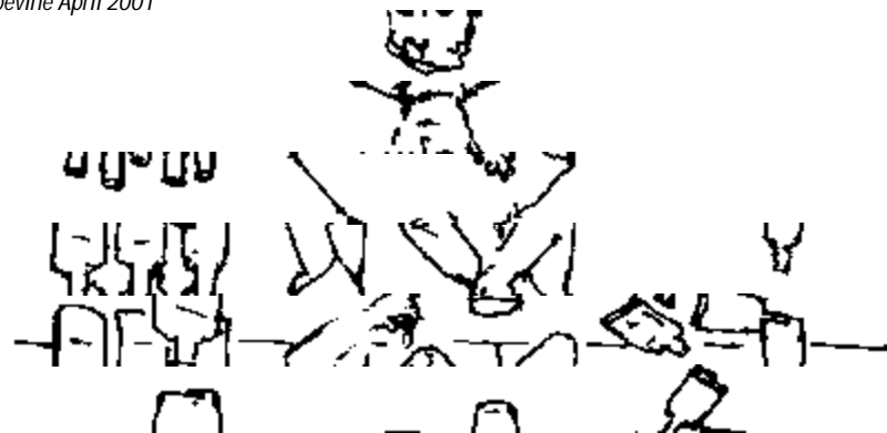
With keen scientific mind, Mike found that going through his empties and heating the bottle, a few more precious drops could be coaxed out of each bottle.