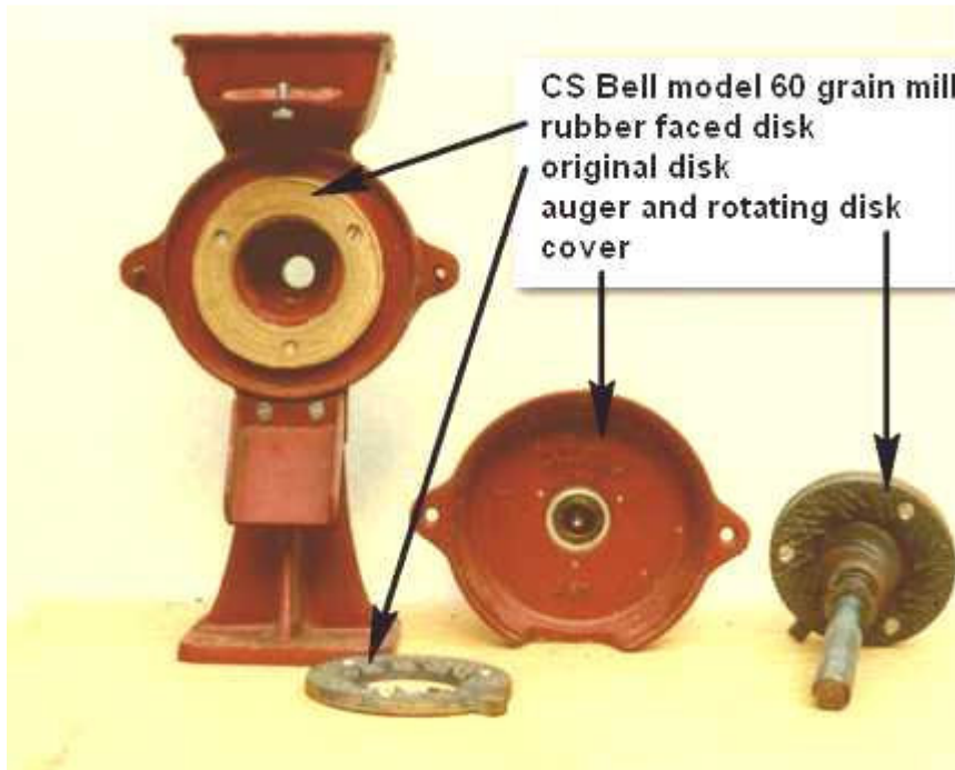
CS Bell grain huller, disassembled. Replaced original stationary disk with rubber faced disk.