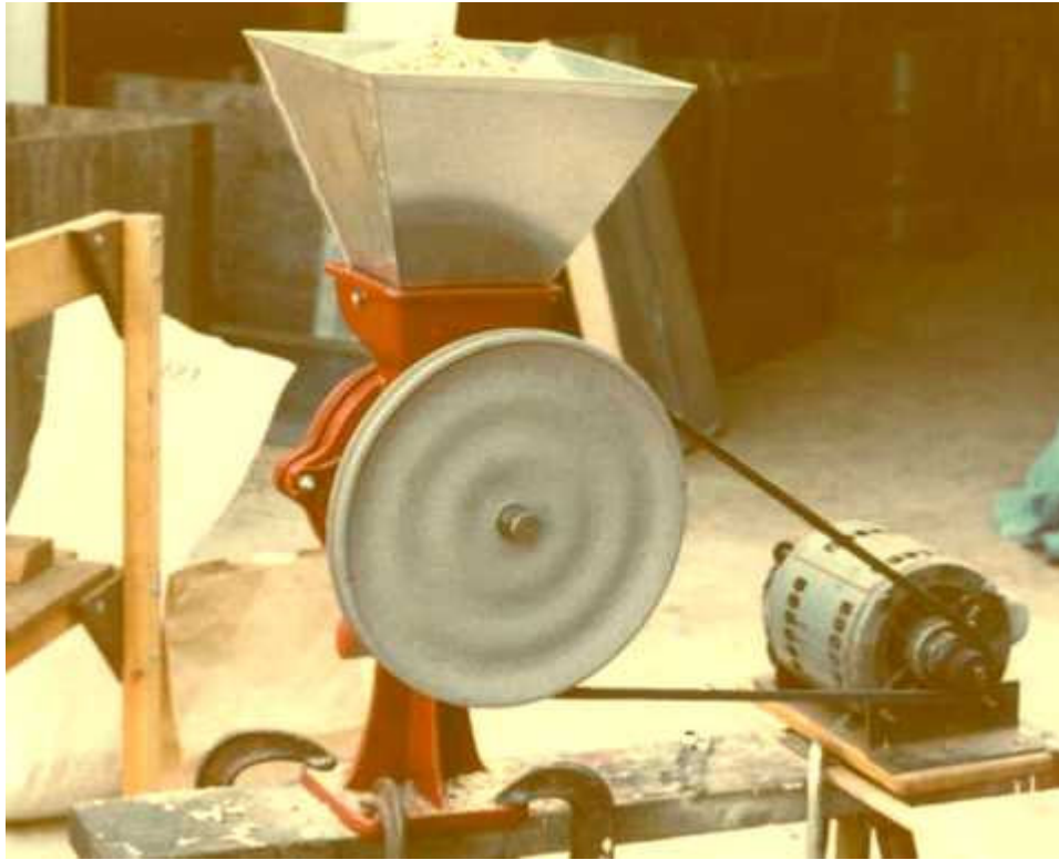
CS Bell Model 60 grain mill motorized and converted to huller