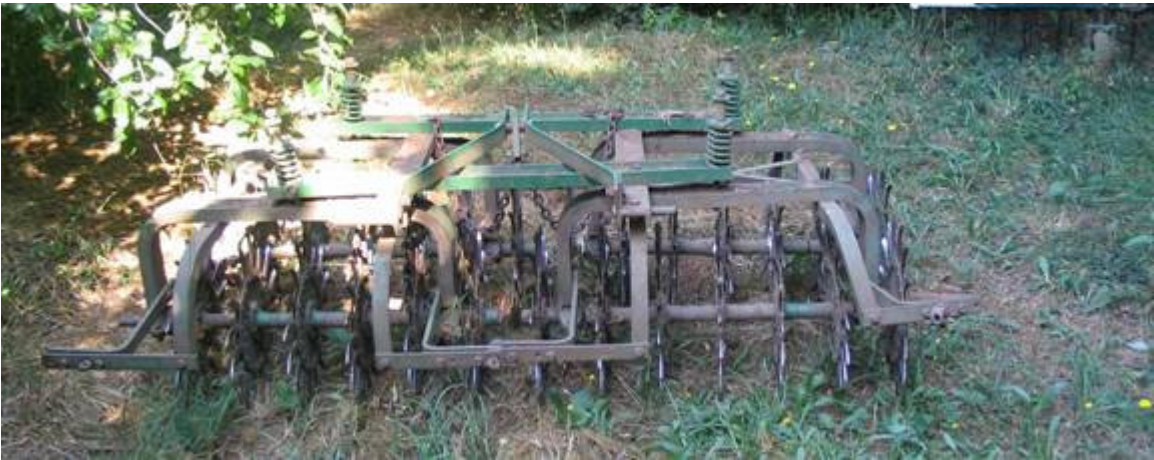
Figure 4. Rotary hoe