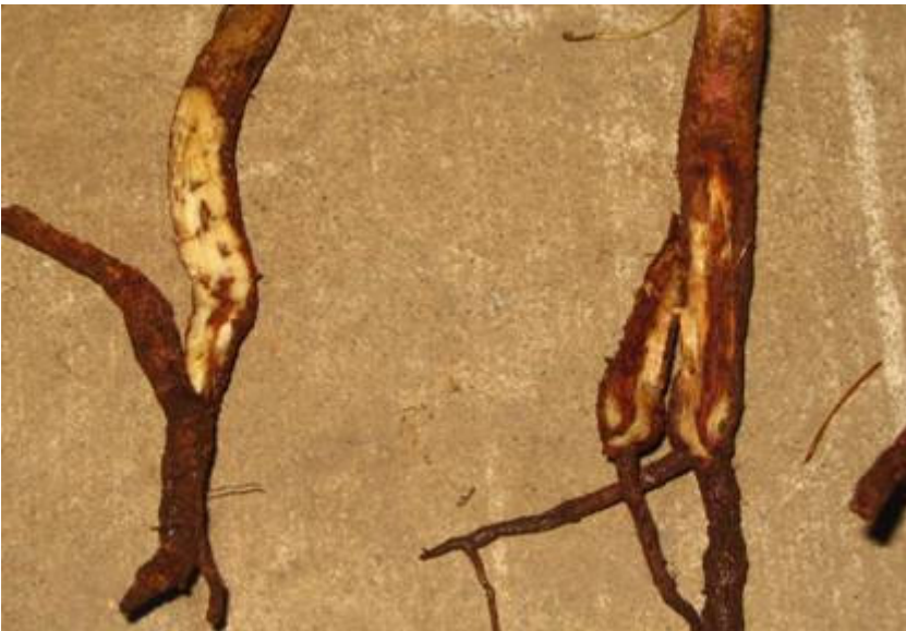
Figure 2. Close up of suspected boron deficient roots. Roots are sliced open to show internal brown corks and lesions.