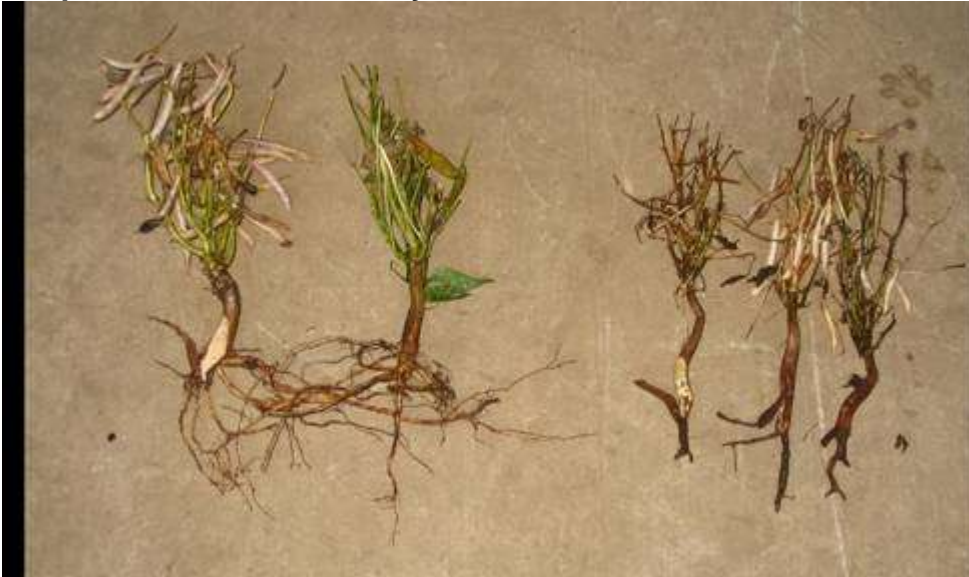
Figure 1. Left: Healthy bean roots, white internal flesh and secondary root growth. Right: suspected boron deficiency: internal brown cork and lack secondary root growth.