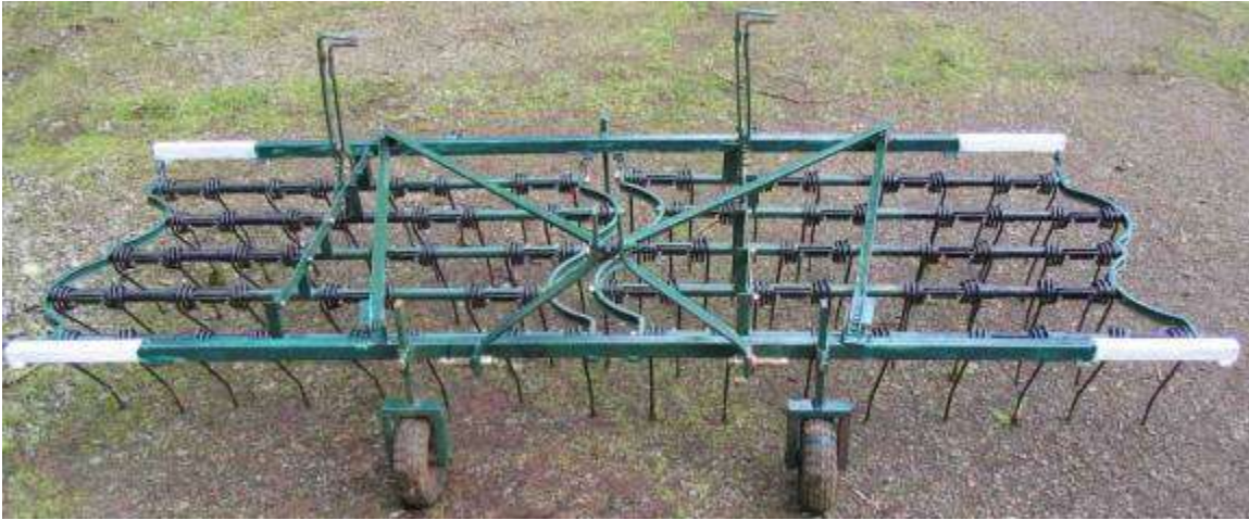
Figure 3. Flex tine cultivator