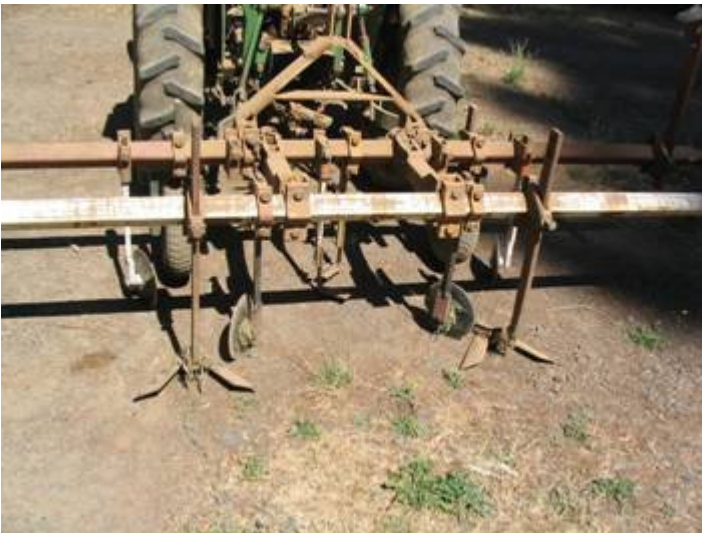
Figure 5. Sweeps and mini disks