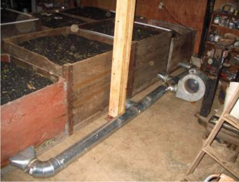
Figure 6. Grain drying bins, made from 4ft x 4 ft totes, connected to a blower.