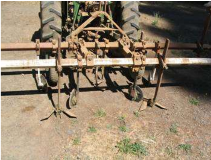
Figure 5. Sweeps and mini disks