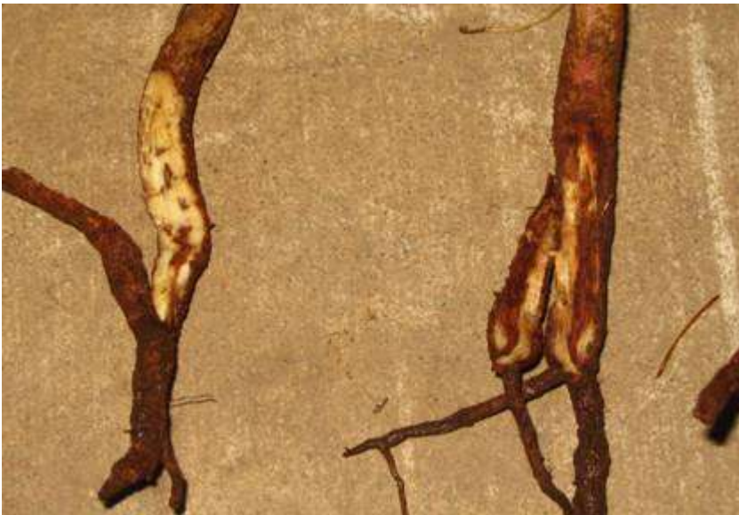
Figure 2. Close up of suspected boron deficient roots. Roots are sliced open to show internal brown corks and lesions.