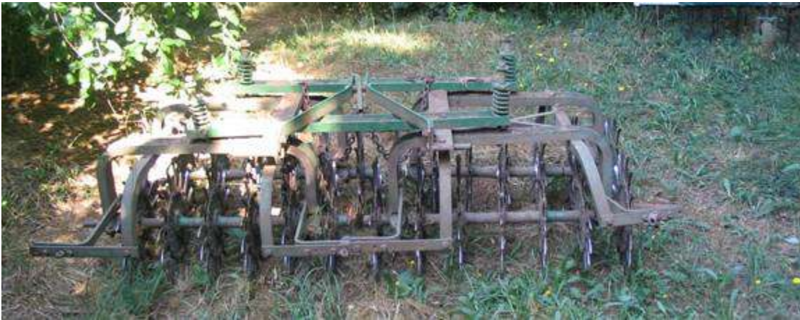
Figure 4. Rotary hoe