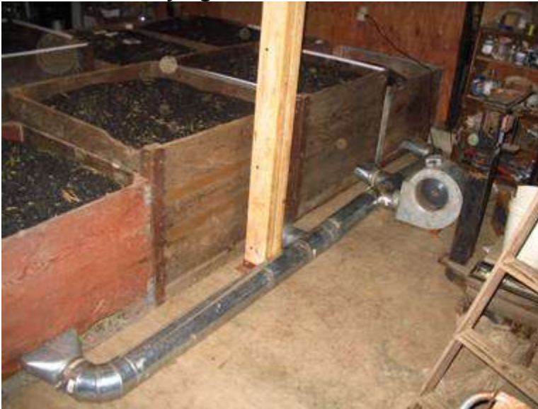
Figure 6. Grain drying bins, made from 4ft x 4 ft totes, connected to a blower.