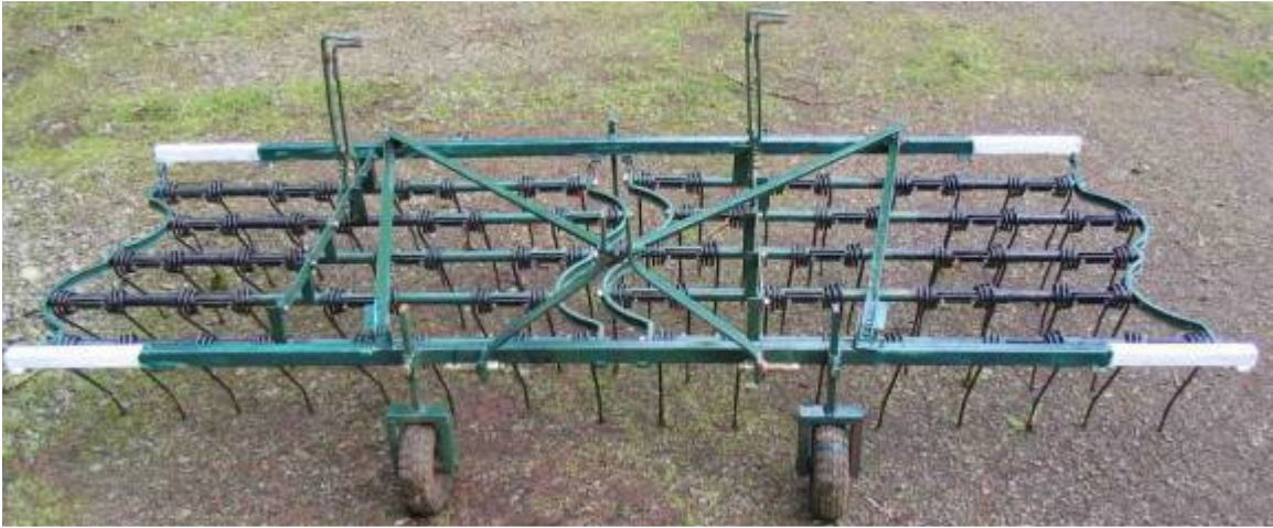
Figure 3. Flex tine cultivator