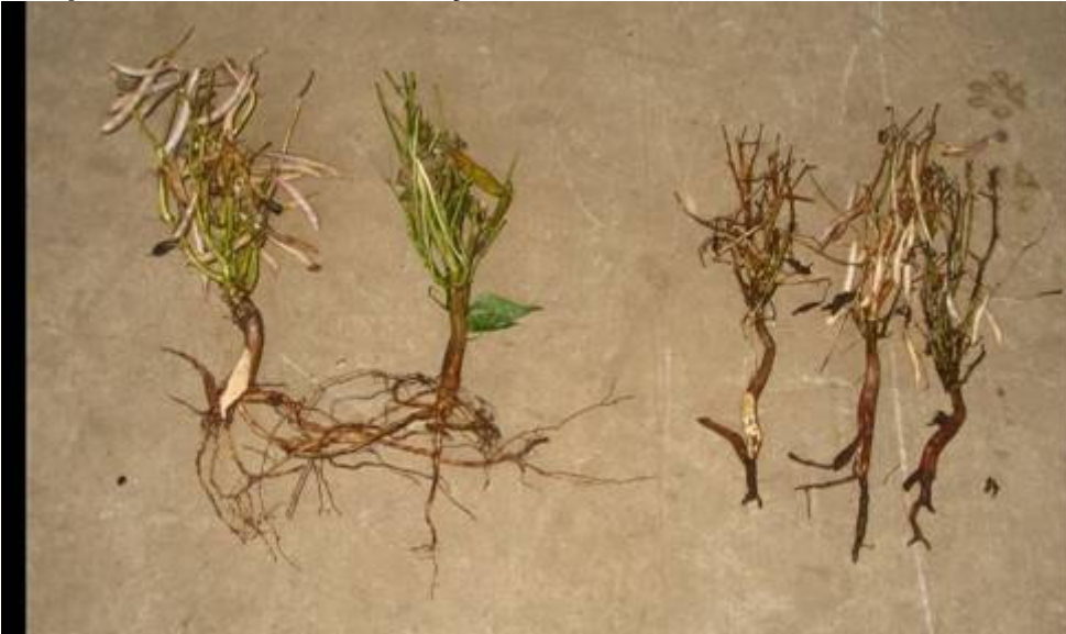
Figure 1. Left: Healthy bean roots, white internal flesh and secondary root growth. Right: suspected boron deficiency: internal brown cork and lack secondary root growth.